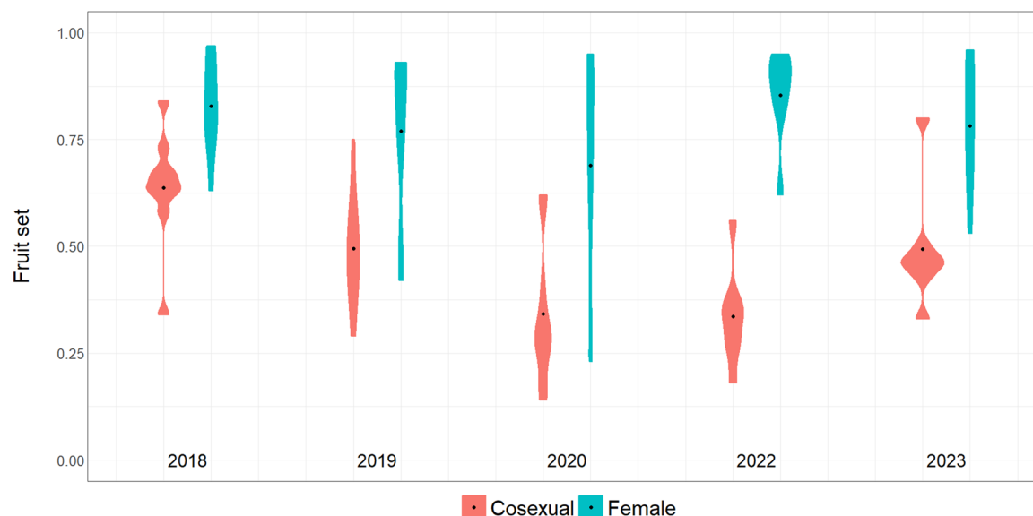
FIGURE 4 Interannual variation in fruit set in cosexual and female chestnut trees. Black dots indicate average fruit set.