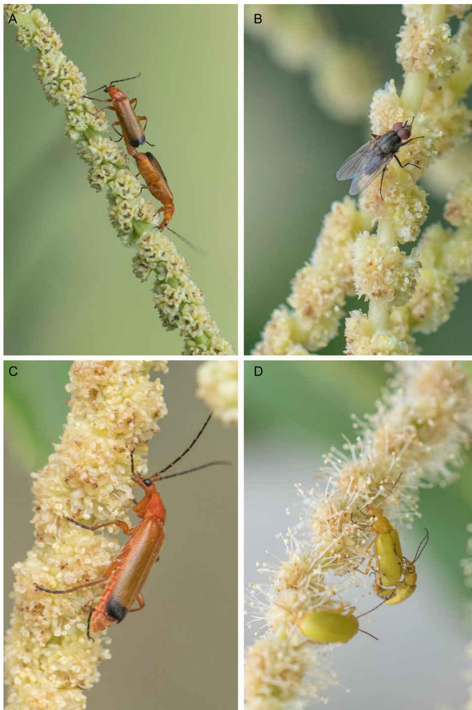
FIGURE 3 Degrees of male-sterility observed. Male-sterile tree: Most stamens are aborted and do not produce pollen (A). Mostly male-sterile tree: Stamens do not protrude from glomerules (B) or slightly protrude from glomerules (C). Fully male-fertile tree: Stamen filaments are long and produce large amounts of pollen (D).

each branch to calculate the cross-sectional area and standardize the number of female inflorescences per square millimeter of branch cross section, which we call “female inflorescences production.” To study whether female trees invest more in fruit production than cosexual trees, we estimated fruit yield as follows: