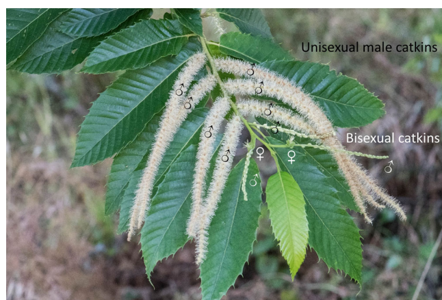
FIGURE 2 Chestnuts have two types of catkins: numerous unisexual male catkins that flower first and a few bisexual catkins located at the tip of the branches that flower later.

Two genders can be distinguished in European chestnuts and their hybrids: cosexuals, which are fully male-fertile trees, and at least partly male-sterile trees, henceforth called females (Larue et al., 2022; Figure 2). Only one gender (cosexual) is reported in Japanese and Chinese chestnuts planted in France. The female trees of European chestnuts or hybrids have dysfunctional staminate flowers with fully aborted stamens or with stamens borne on short filaments producing only small quantities of mostly nonfunctional pollen (Bounous et al., 1992). We have evaluated the male fertility of these different categories of trees using paternity